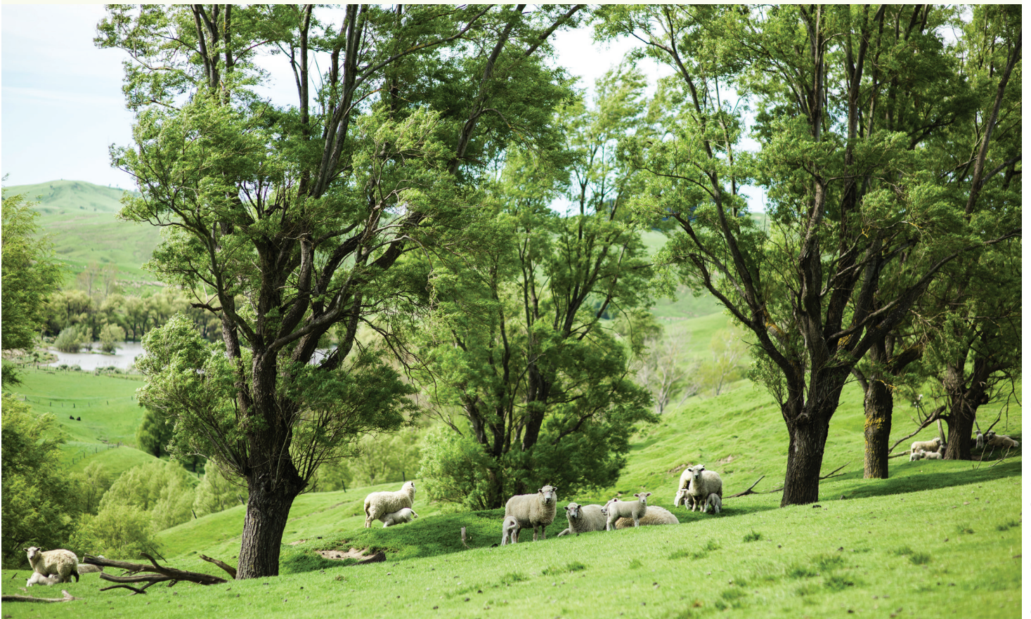
Sheep, Rangitoto Station