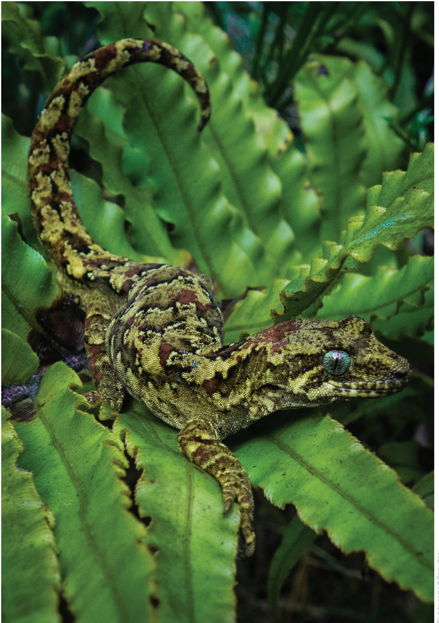
Tautuku gecko