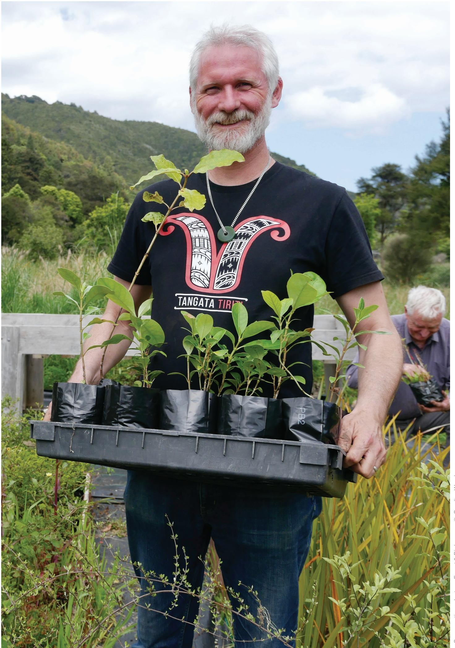
Conservation volunteer, Forest & Bird nursery