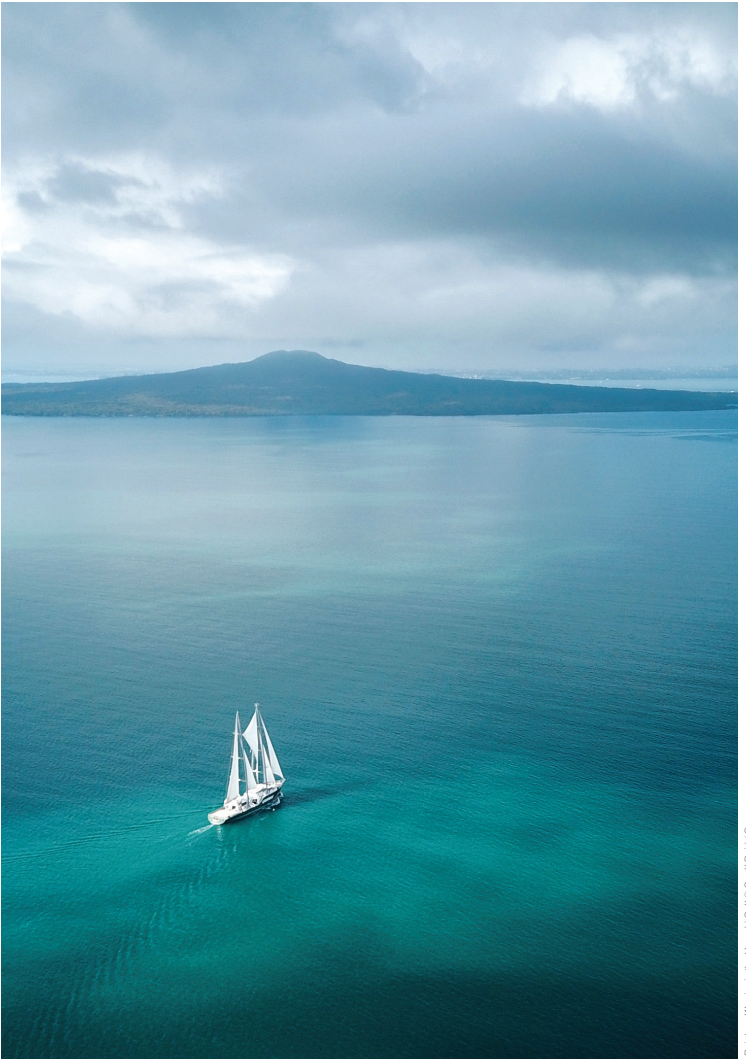
Rainbow Warrior in the Hauraki Gulf