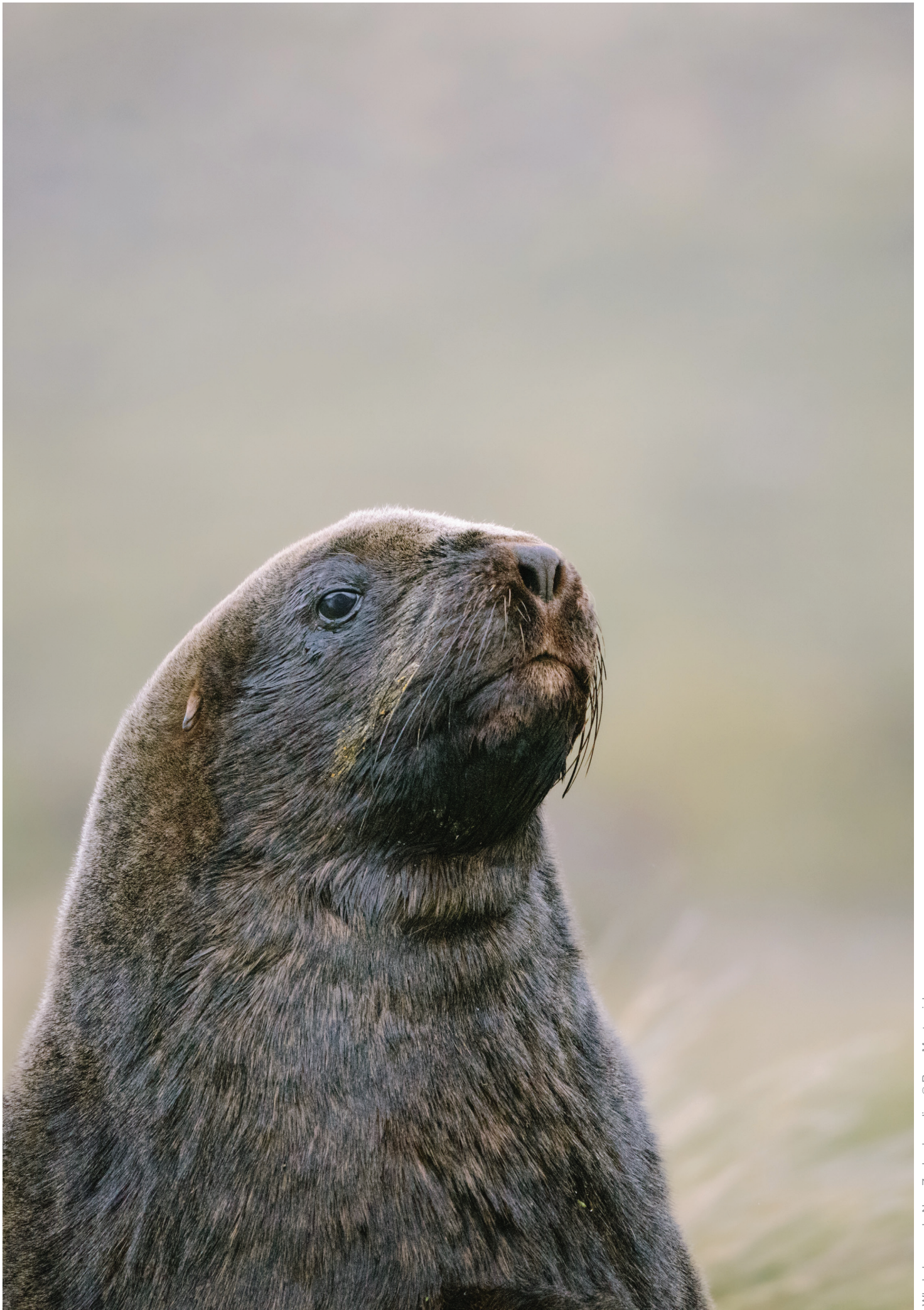
Whakahao, male New Zealand sea lion