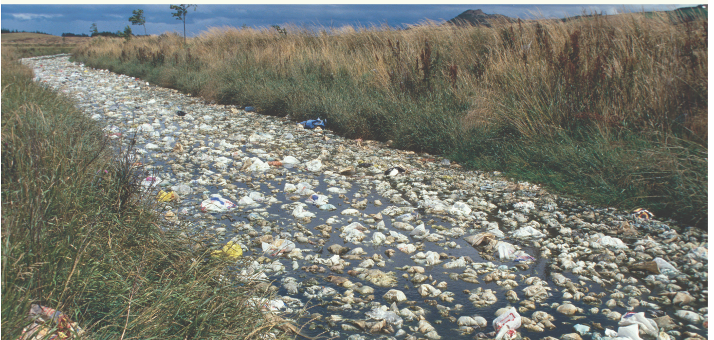
Garbage dumped in river near Dunedin