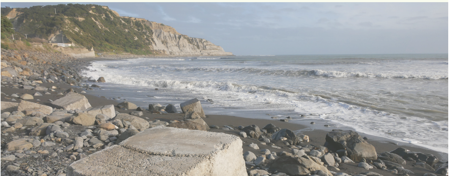
Coastal erosion, Palliser Bay, Wairarapa